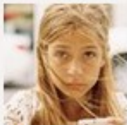
Jura de Wel