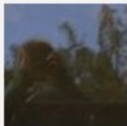
Faust de Wel